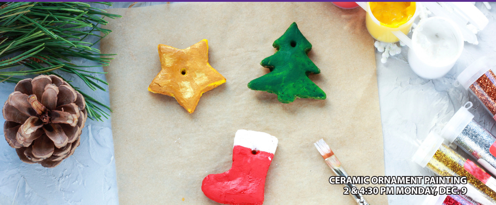
CERAMIC ORNAMENT PAINTING 2 & 4:30 PM MONDAY, DEC. 9

Registration is required for all programs, unless noted.