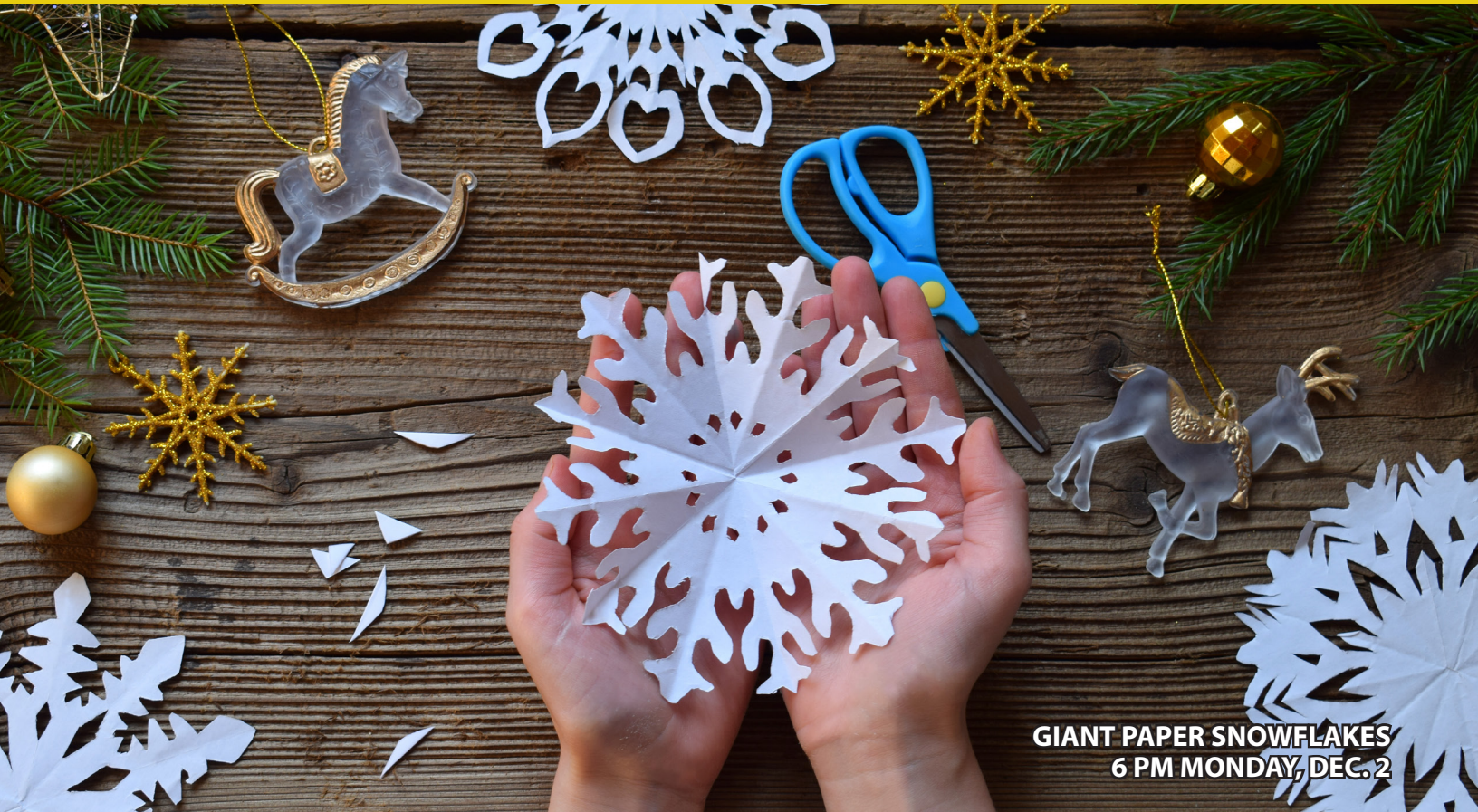
GIANT PAPER SNOWFLAKES 6 PM MONDAY, DEC. 2

Registration is required for all programs, unless noted.